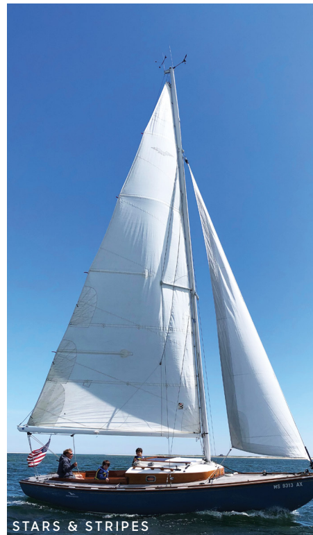
STARS & STRIPES